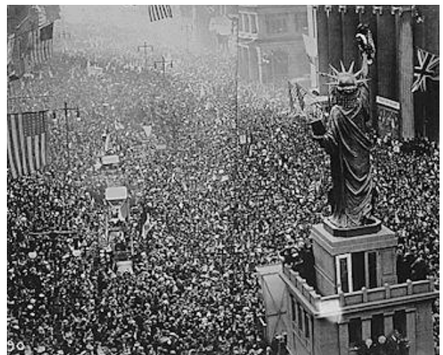
A giant Armistice celebration in Philadelphia, PA, includes a Statue of Liberty replica.

Allied soldiers, sailors and Red Cross workers celebrating the end of World War I, November 11, 1918.