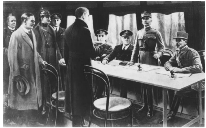
Allied and German officials at the signing of the armistice that ended the fighting in World War I, November 11, 1918.