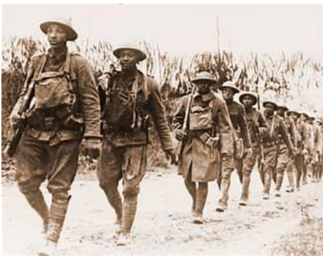
World War I: A Global Catastrophe

While formally recognizing and honoring those who have worn — and now wear the nation’s colors on this one day — veterans are remembered by appreciating their experiences and building on their legacy of service. President Ronald Reagan once remarked, “Veterans know better than anyone else the price of freedom, for they have suffered the scars of war. We can offer them no better tribute than to protect what they have won for us.”