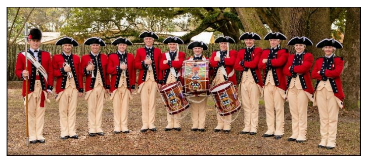
The Army Old Guard marched in the Order of Inca Mardi Gras parade in Mobile, AL