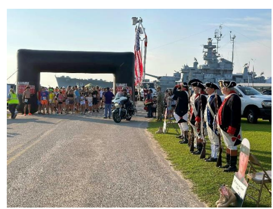
Soldiers of the American Revolution