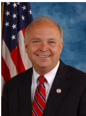
Jo Bonner, the University of South Alabama President, has been selected as the Mobile Bay Area Patriot of the Year for 2023.

Home - Boys & Girls Clubs of South Alabama (bgcsouthal.org)