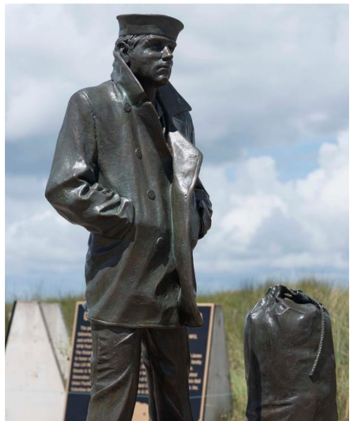
The Lone Sailor standing watch at the beaches of Normandy

lbarker@navymemorial.org or 202-380-0726.