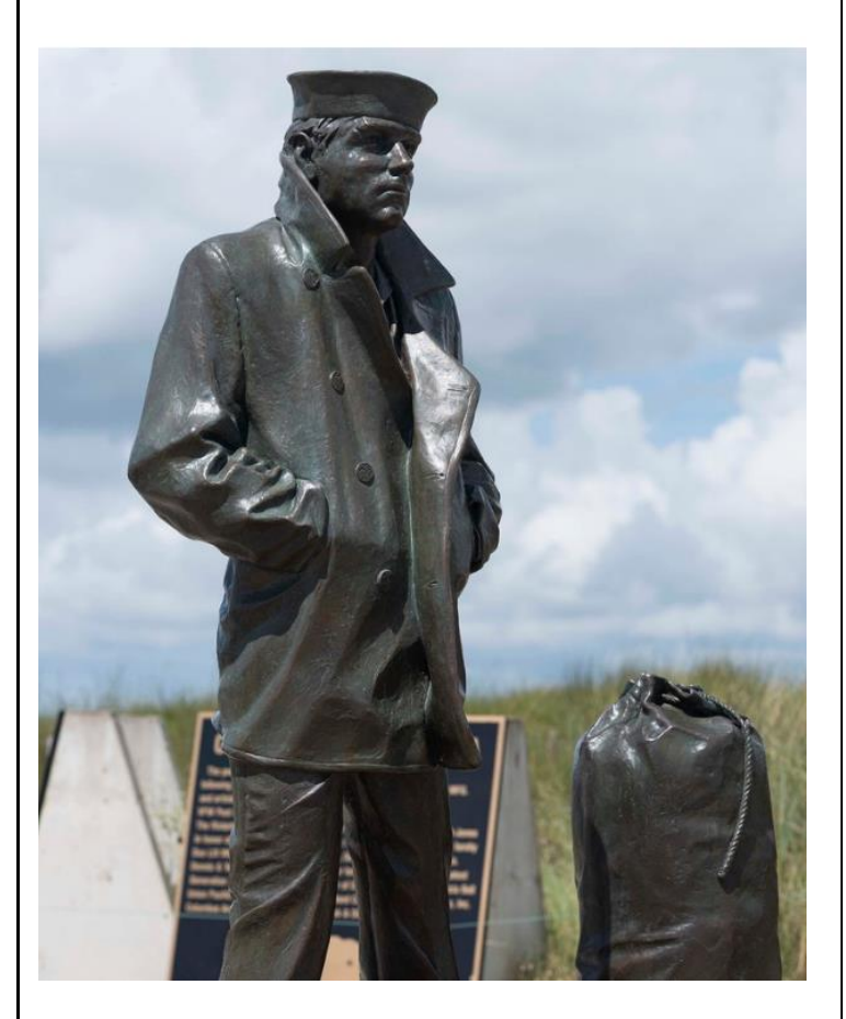
The Lone Sailor standing watch at the beaches of Normandy

lbarker@navymemorial.org or 202-380-0726.