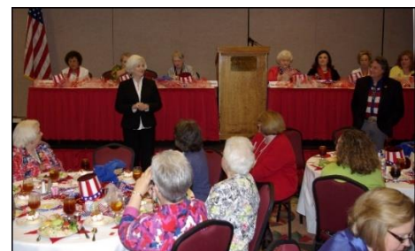
Honor Flight Presentation at National Convention Perdido Beach - April 2013