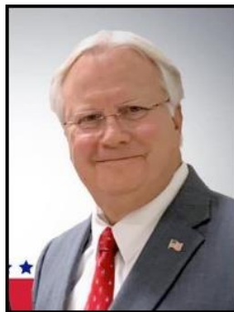
Congressman Jerry Carl