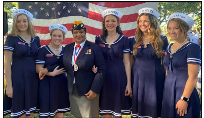
USS Alabama Crewmates