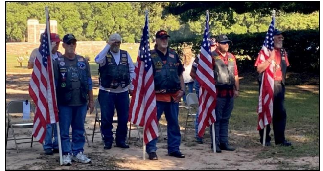
Patriot Guard Riders