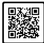
Armed Forces Day Mobile

Alabama's 17 th Annual Armed Forces Day Blue Star Salute 5K Memorial Run/Walk & 1 Mile Fun Run FOR ALABAMA'S FALLEN HEROES USS ALABAMA Battleship Memorial Park Vendors on display from 7 a.m. – 1:00 p.m.