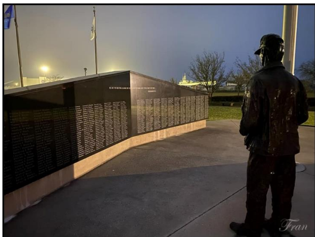
Vietnam Veterans Memorial Battleship Memorial Park, Mobile, AL