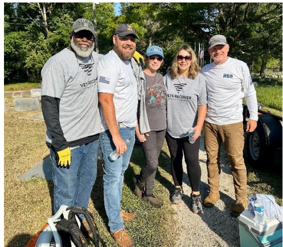
Vets Recover Team at Historic Oaklawn Memorial Cemetery