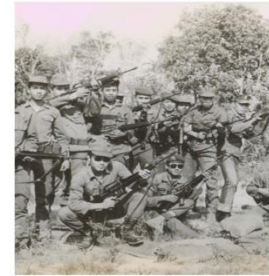
Lao SGU/RLA soldiers in the field.