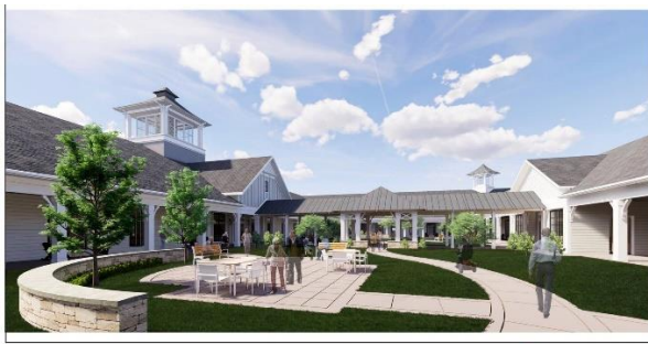
WILLIAMS BLACKSTOCK ARCHITECTS A NEW VETERANS HOME ALABAMA DEPARTMENT OF VETERANS AFFAIRS ENTERPRISE, ALABAMA

The site of the new state Veterans home named in honor of Command Sgt. Maj. Bennie Adkins will be on 108 acres off Highway 51 just north of Yancey Parker Industrial Park in Enterprise. The facility will be approximately 182,000 square feet and house 175 residents. Once in full operation, it is expected to provide jobs for more than 200 people.