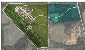
WILLIAMS BLACKSTOCK ARCHITECTS A NEW VETERANS HOME ALABAMA DEPARTMENT OF VETERANS AFFAIRS ENTERPRISE, ALABAMA