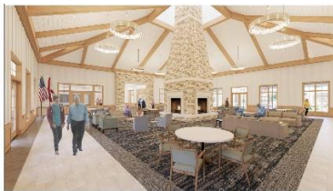
WILLIAMS BLACKSTOCK ARCHITECTS A NEW VETERANS HOME ALABAMA DEPARTMENT OF VETERANS AFFAIRS ENTERPRISE, ALABAMA