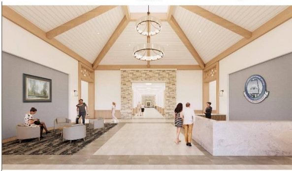
WILLIAMS BLACKSTOCK ARCHITECTS A NEW VETERANS HOME ALABAMA DEPARTMENT OF VETERANS AFFAIRS ENTERPRISE, ALABAMA