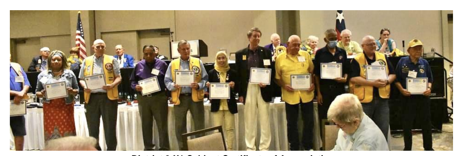
District 2-X1 Cabinet Certificate of Appreciation