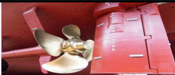
RUDDER & PROPELLER