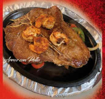
Arroz con Pollo

Mix of grilled chicken, steak, fish, shrimp & chorizo paired with green onions, spicy jalapeños, a slice of queso fresco & nopal. Served with rice, beans & tortillas.