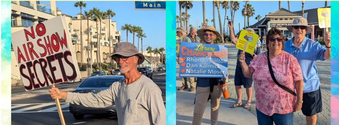
Thank you to all the participants!