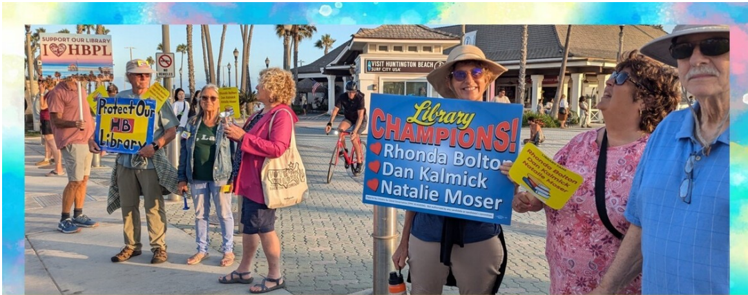
March to the Pier in support of HB Libraries 8/23/24