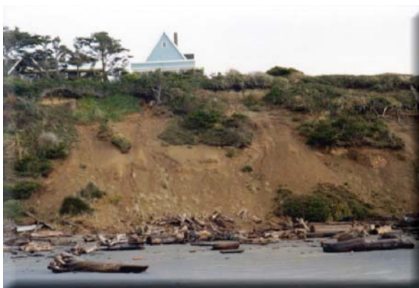
Coastal Slope Stability Mapping