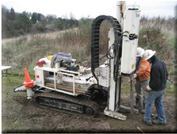
Shallow Core Drilling

Geohazards Critical Areas Geologic Data Slope Stability Mapping Subsidence Investigations Fault Mapping