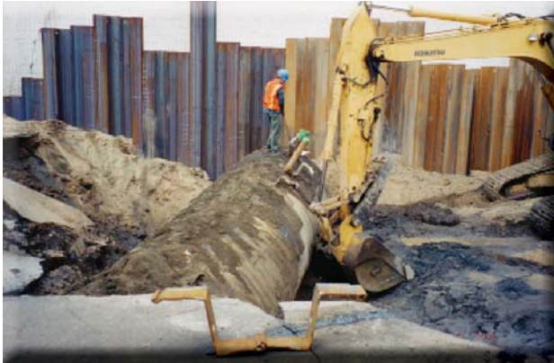
Sheet Pile Slope Protection During Tank Removal