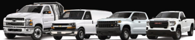
2019 Chevrolet Silverado 6500HD 1 Chassis Cab | 2019 Chevrolet Express 2500 Cargo Van | All-New 2019 Chevrolet Silverado 1500 | Next Generation 2019 GMC Sierra 1500

We're in the offering NAHB members up to $1,000 business.