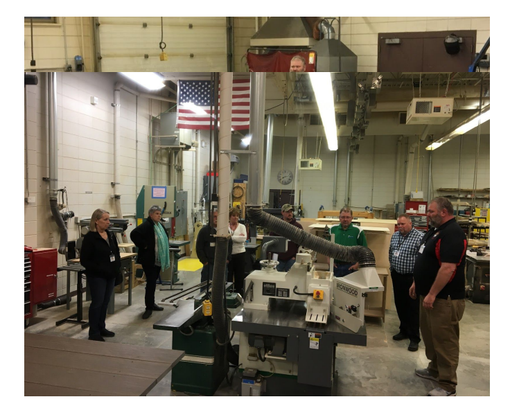
Metal Shop Tour (above and below)

Scenes from Hard Hat Happy Hour at Shawano Community High School Tuesday, April 9, 2019