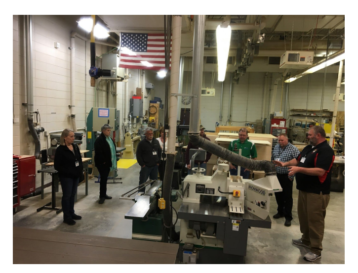
Wood shop tour