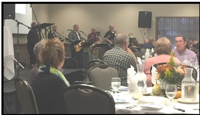
The Green Lake Bluegrass Band provided entertainment at a recent Family Promise Donor Dinner on October 14.

At the Family Promise County level, a Donor Dinner took place the evening of October 14. Musical entertainment was provided by Green Lake Bluegrass Band. Financial donations given to Family Promise of Kandiyohi County support the Director/Case Manager position, as well as the expenses of the van, and Day Center. Donation envelopes are always available at the Welcome Center.