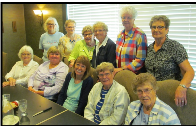
WELCA Fun Day!