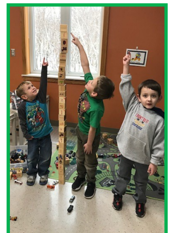
How do we measure up?