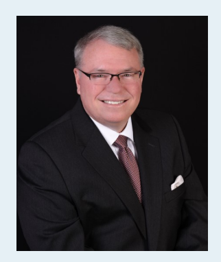
www.OlympusTax.com CA Lis: 0K67189

I help families and business owners pay less tax and enjoy more life, Guaranteed!