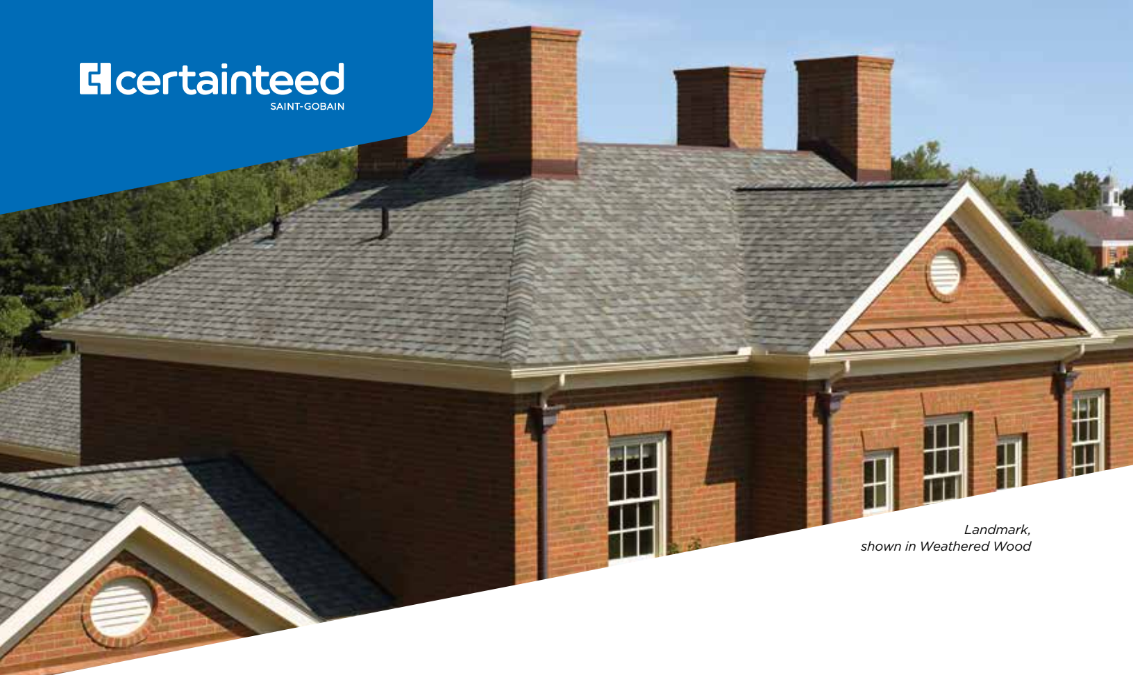
Landmark, shown in Weathered Wood