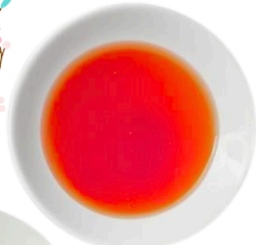
S3- Serkeh Vinegar (patience)