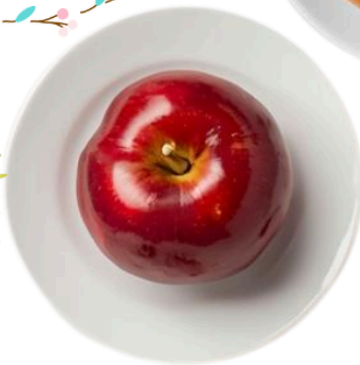
S4- Seeb Apple (beauty & health)