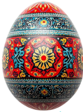
Painted Egg (fertility)