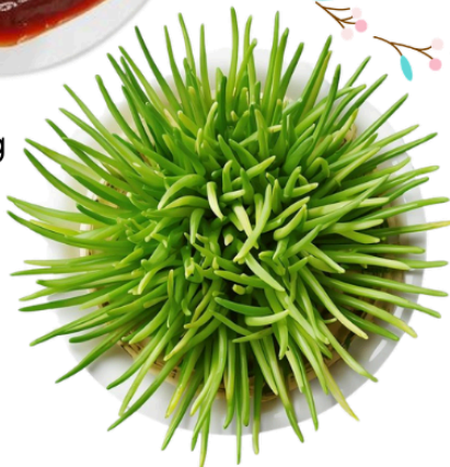
S5- Sabzeh Sprouts (new life)