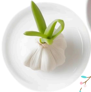
S7- Seer Garlic (health & protection)