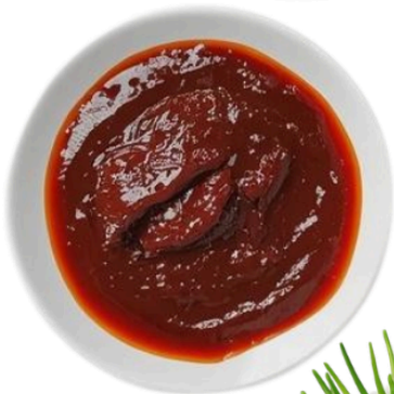
S6- Samanu Sweet pudding (strength & abundance)