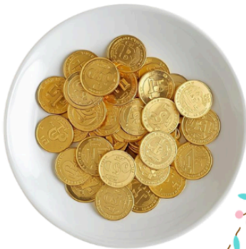
Coins (prosperity & wealth)