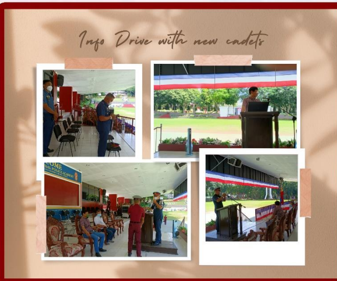
Info Drive with new cadets