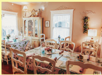
Lavendar and Lace