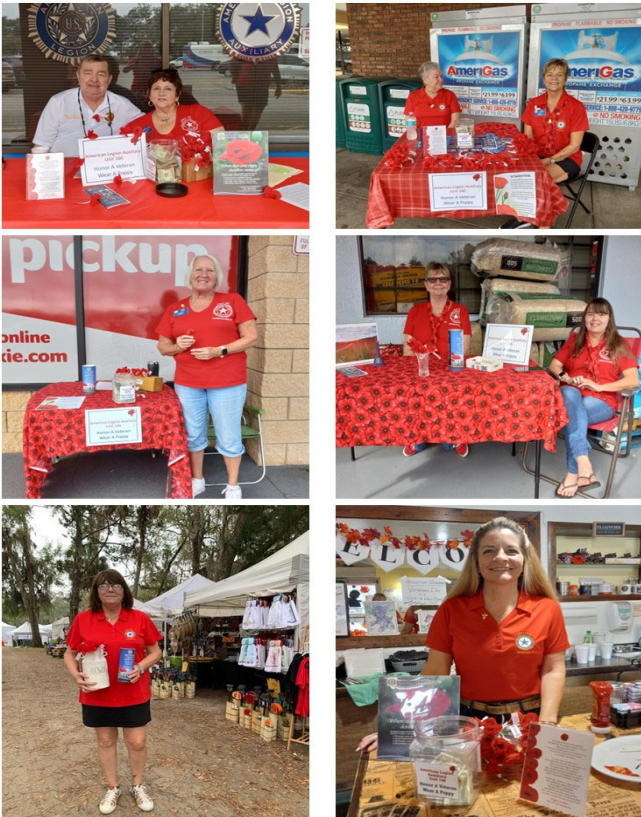
Walden Woods and 2nd shift at Post not pictured

Veterans Day was a busy day for us. In addition to honoring our Veterans with a gift, cards and meals, our Poppy teams were out in the community, passing out Poppies in honor of our Veterans. The folks were very generous with their donations which will allow us to help more veterans in need, or their families, and our community.