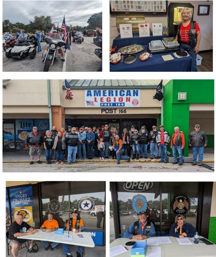
For the cause, not the Applause

The fifth annual Hams N Hogs Charity Ride was successful again this year. We were able to donate 3 hams and a large monetary donation to the Citrus County Veterans Coalition Food Pantry, ensuring a holiday meal for Veterans in need. Thanks to everyone who donated Gift Cards for the Raffle and donations for the Food Pantry.