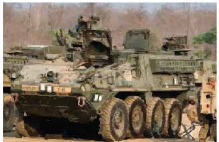
M1126 Infantry Carrier Vehicle