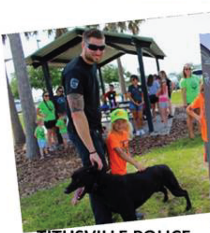
TITUSVILLE POLICE DOG DEMONSTRATION