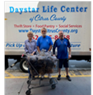
Hams For Daystar Life Center