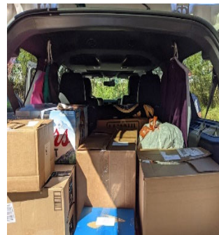
Donations for Blessing Buckets