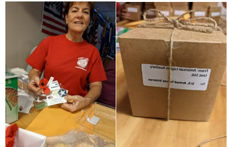
Preparing 'Care Packages' for Veterans Day