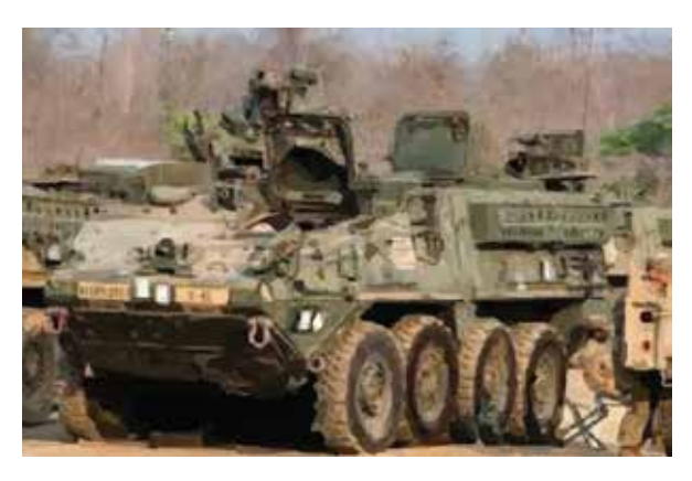
U.S. Army M1126 Stryker ICV