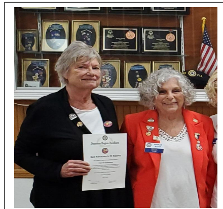
Unit 166 received Award for the Best Year End Narrative Reports