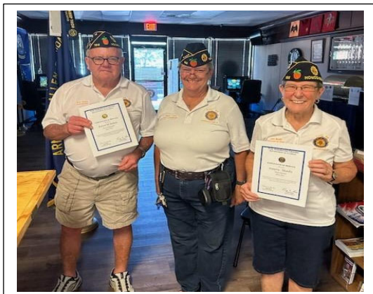
Post Commander and Adjutant each receive a Certificate of Service of Distinction & Honor