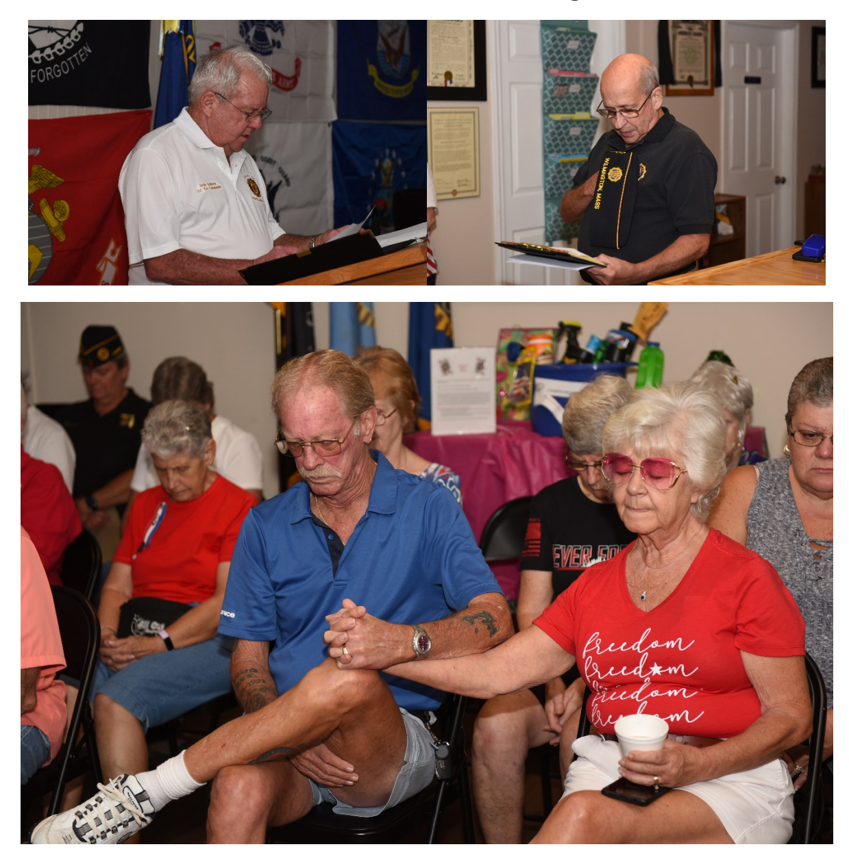
Post 166 Members Donate Blood