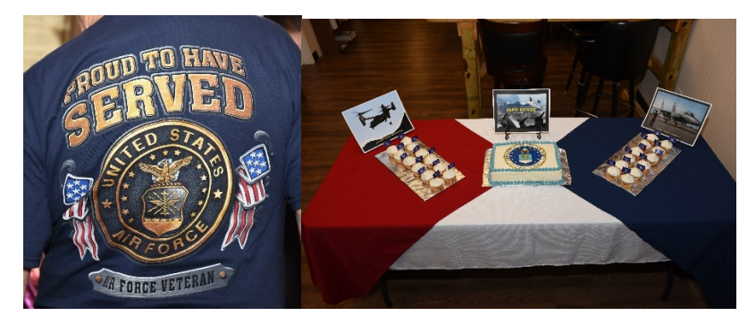
Our USAF Veterans Share their Memories