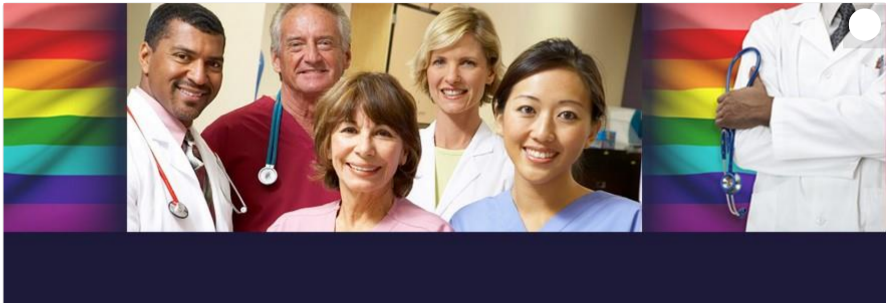
LGBT Health Services

People who are lesbian, gay, bisexual, or transgender (LGBT) are members of every community. They are diverse, come from all walks of life, and include people of all races and ethnicities, all ages, all socioeconomic statuses, and from all parts of the country. The perspectives and needs of LGBT people should be routinely considered in public health efforts to improve the overall health of every person and eliminate health disparities.