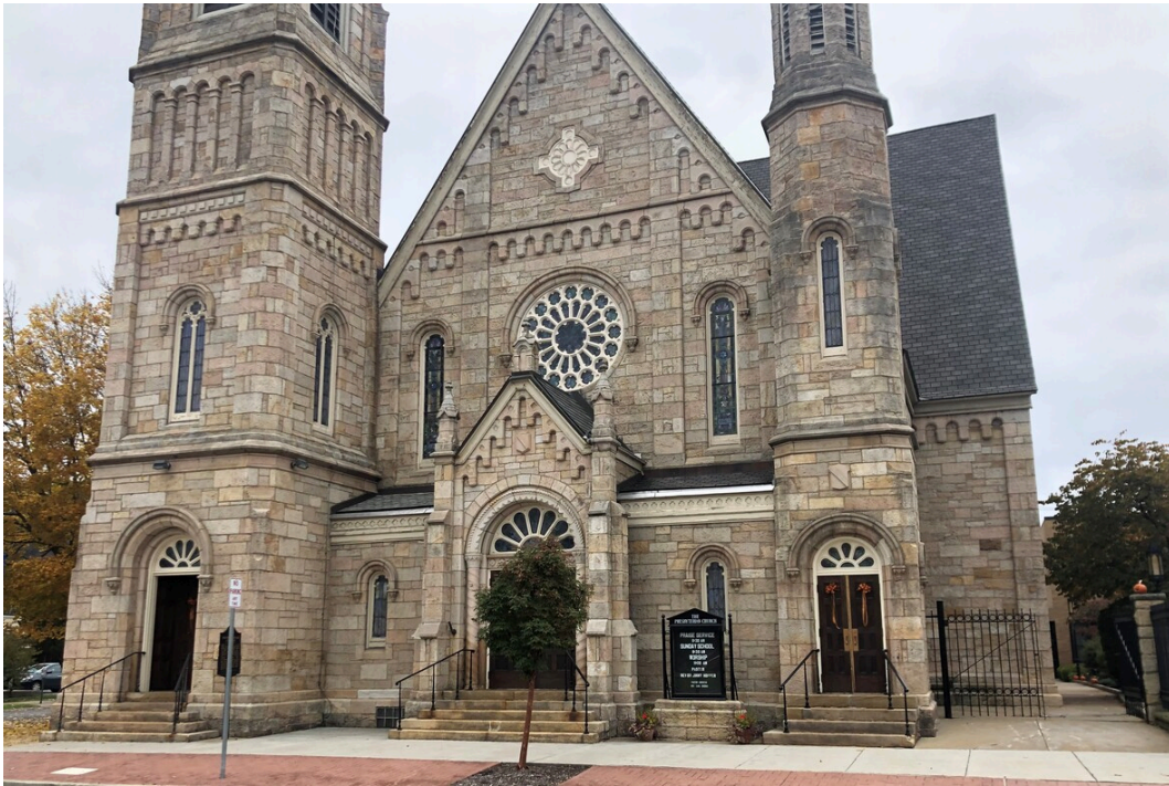
The Clearfield Presbyterian Church was built in 1869 and is still a vital part of the community.