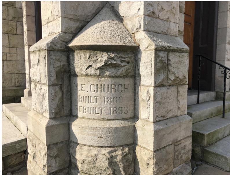
Cornerstone to the church showing the dates of construction