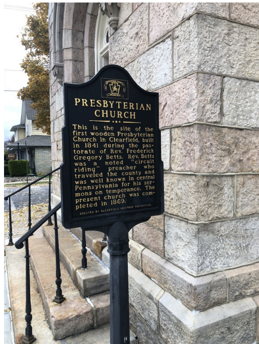
The entrance to the church and the sign datelining its construction. The church is over a 150 years old, still in service and the stone still looks to be in remarkable condition.