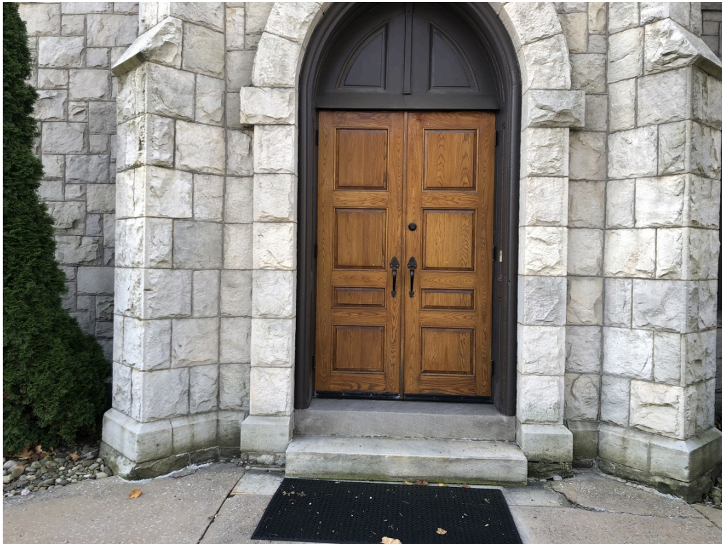
Entrance to the church