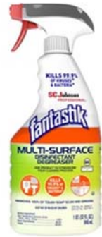
Fantastik - MULTI-SURFACE DISINFECTANT, SANITIZER, DEGREASER 32OZ Bottle SJN311836