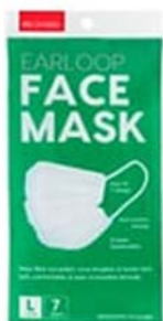
Iris Face Mask, Large, 7/Pack (590040)