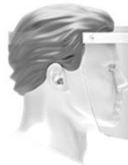
Deflecto Disposable Personal Face Shield with Foam PFMD100F