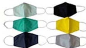
ORLY Reusable Cloth Face Masks for Kids, Elastic Strap, Assorted Colors, 10/Pack (HB-0048-ST)