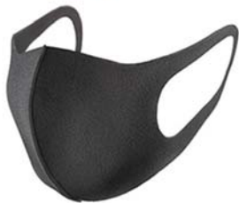
Adult | Washable Everyday Face Mask | 1/EA ICC2LRMASK

Special Order: The items shown below are not returnable and orders cannot be canceled once placed.