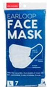
Iris Earloop Disposable Face Mask, Individually Wrapped, Large, 7/Pack (590017)

* non-sterile mask intended for general single use