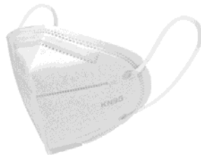
Extra Protection KN95 5-Layer Face Mask | 2/pk ICCKN95PK