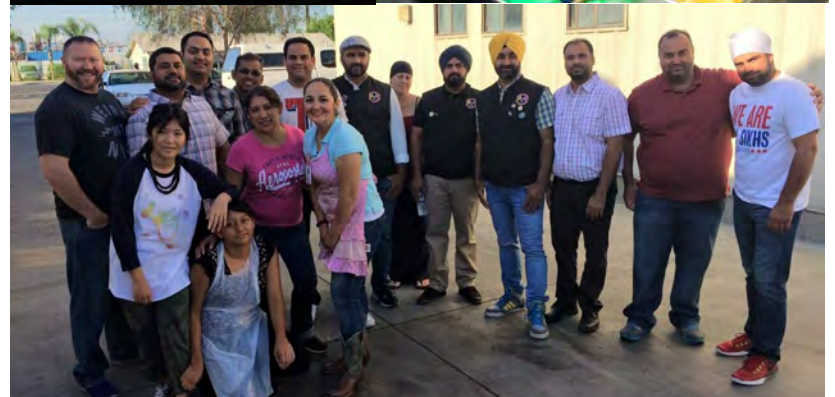
SROA commemorated Vaisakhi by providing all meals to the community at the Bakersfield Homeless Shelter complying with the important Sikh value of sharing with the needy.