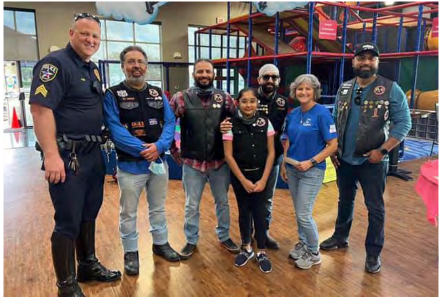
Donation to Irving Police & Fire Blue Christmas - Texas

Dec 18 SROA attended Toy Run hosted by Bikers Against Bullies - Florida