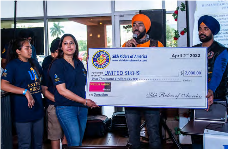
Solidarity Ride for Ukraine - Florida. SROA donated to United Sikhs, a global charity dedicated to service for humanity and an organization that is currently on the front lines aiding Ukrainian Refugees.