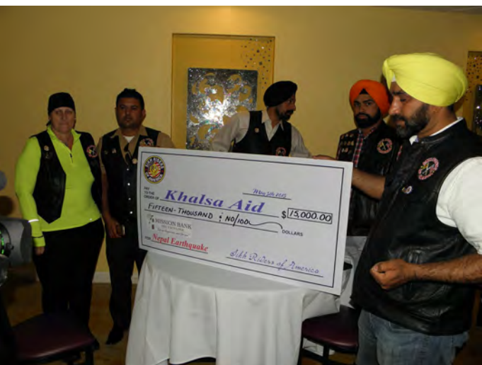
SROA held a fundraiser in Bakersfield to assist victims of the devastating 7.8 magnitude quake in Nepal which killed 8,964 people and injured 21,952 more. Funds were sent to Khalsa Aid to assist with their on the ground humanitarian efforts.