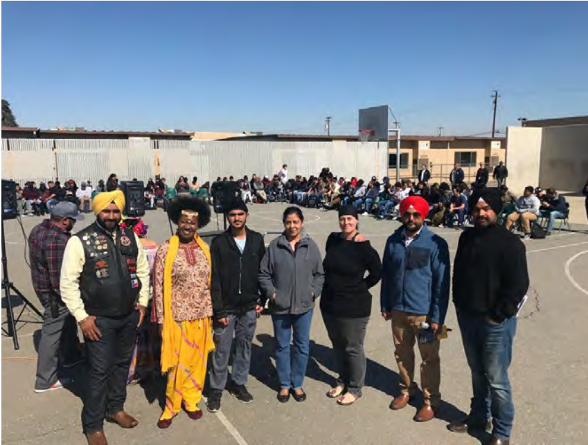
Sikh Awareness Seminar at Vista High School, CA

Students were receptive, respectful and inquisitive - asking some really great questions about both the culture and the religion.