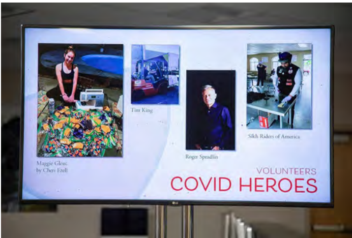
"Heart for Bakersfield" - virtual event celebrating our COVID Heroes. Thank you, COVID Heroes, for your service!" - GARDEN PATHWAYS