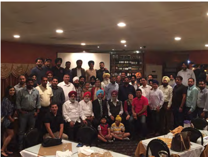
SROA raised over $12,000 at a dinner fundraiser to further a national campaign aimed at presenting an accurate view of Sikhism in the national media.

This designation has allowed Sikh communities to forge better relationships with their government officials, educate their neighbors about Sikhs, and initiate important dialogues on how to address important issues facing Sikh Americans.