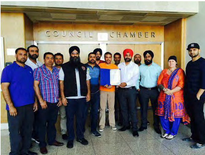
SROA was presented with Proclamation by the City Council of Bakersfield declaring November as Sikh Awareness & Appreciation Month.