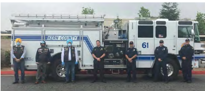
"Thank you SROA for your donation of 1,100 face shields for our fire fighters today! We appreciate your support of our first responders." - KERN COUNTY FIRE DEPARTMENT