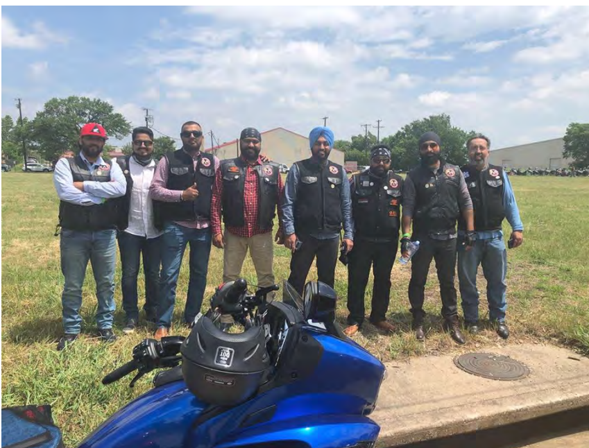
Inaugural Torch Ride benefiting Special Olympics, Texas

Students were receptive, respectful and inquisitive - asking some really great questions about both the culture and the religion.