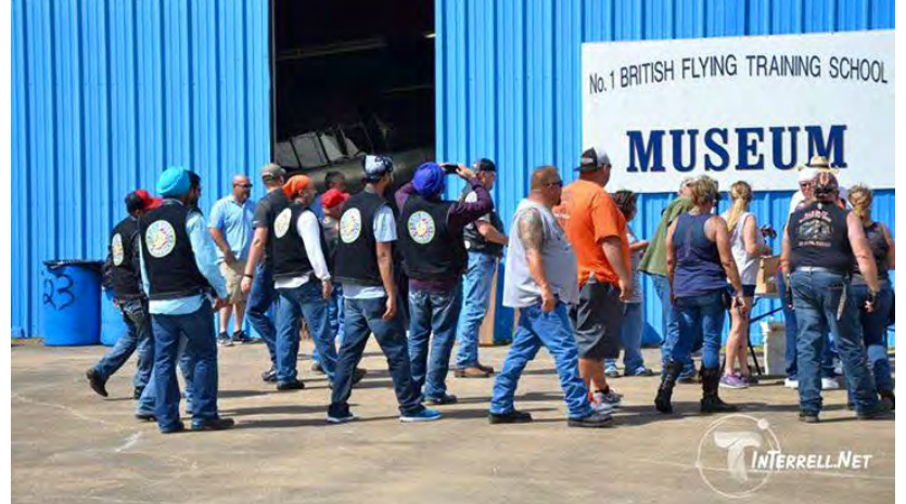
Bikers from across the United Kingdom, US, Canada, So Africa, France & New Zealand participated in the 7th Annual Allied Memorial Remembrance Ride creating one ride in remembrance of our fallen heroes from the Allied Forces, past and present, who paid the ultimate sacrifice.