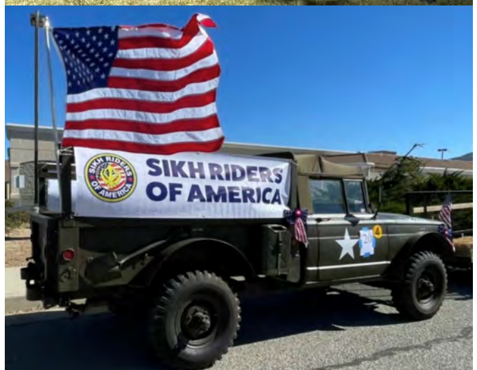
SROA participated in Annual Memorial Day Parade hosted by American Legion Post 221 - Tehachapi, CA