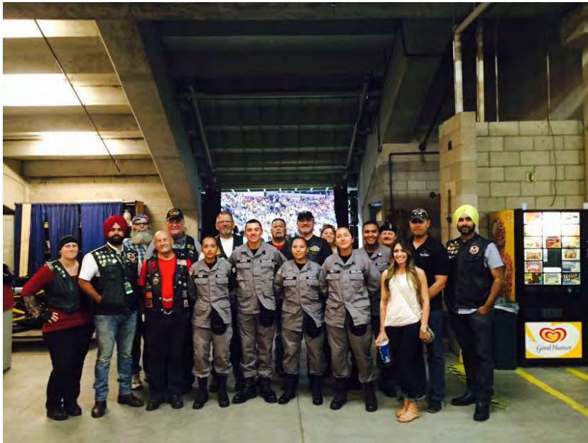
US Army's All Star Bowl XV event - Bakersfield, CA