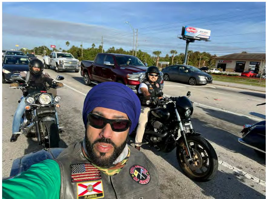
SROA Florida attended the Toy Run hosted by Bikers Against Bullies. It was an amazing and heart-warming experience.