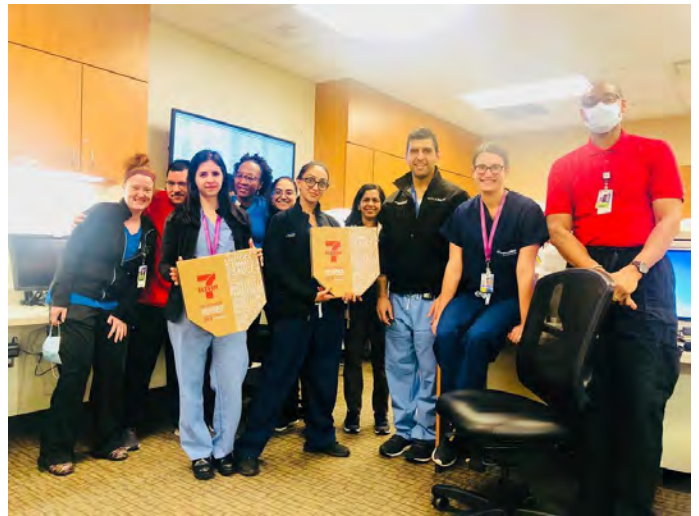
In appreciation of our front line fighters during these unprecedented times, SROA provided lunch twice a week for the staff of Parkland Hospital - Texas