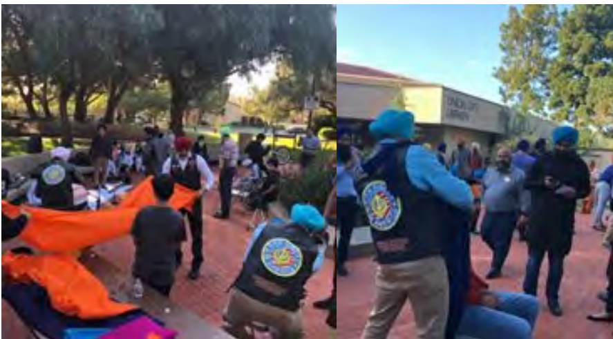
Sikh Turban Day Celebration, Union City, CA

Turbans are an important part of the Sikh identity. Both women and men may wear turbans. Like the articles of faith (referred to as the "5 K's"), Sikhs regard their turbans as gifts given by their beloved Gurus, and their meaning is deeply personal.