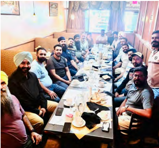
SROA Planning Meeting 10th Annual Ride - Bakersfield, CA