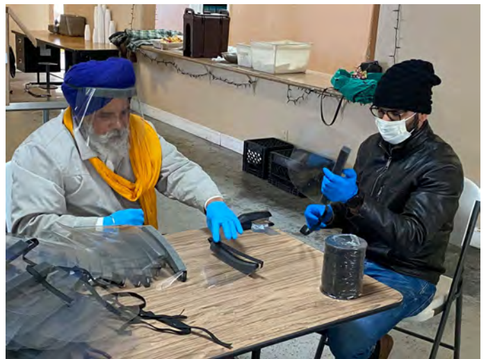
On April 10, 2022 SROA teamed up with Riverlakes Community Church to create protective gear to be used by first responders (firefighters, law enforcement, medical providers etc.)