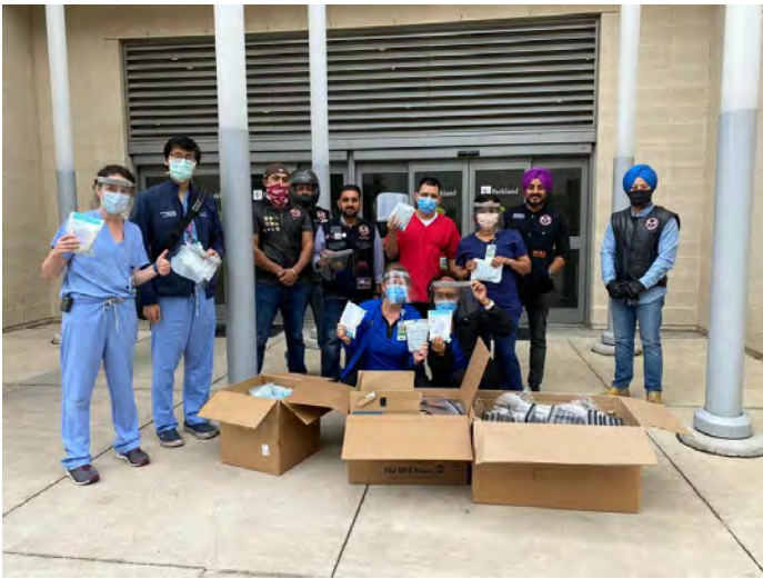
SROA donated face shields and face masks to Parkland Hospital ENT OPC Department - Dallas, Texas