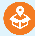
Supply Chain & Logistics