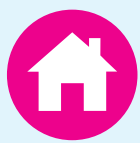
Home & Buildings