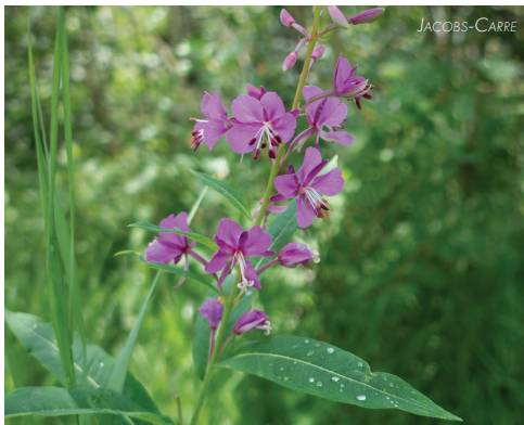
Fireweed Epilobium angustifolium