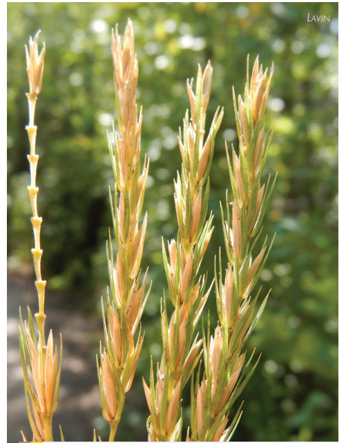
Virginia Wild Rye Elymus virginicus