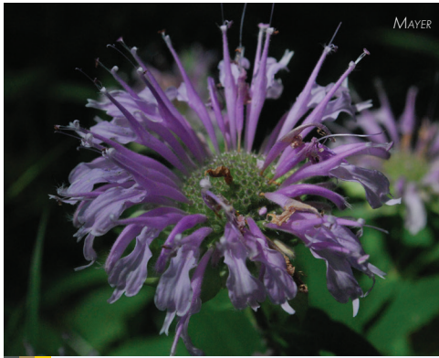
Wild Bergamot Monarda fistulosa