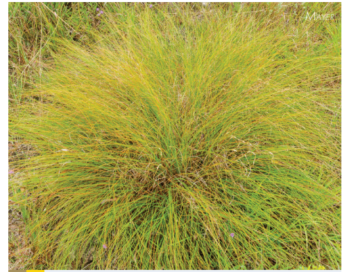
Prairie Dropseed Sporobolus heterolepis