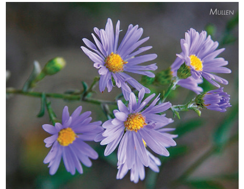
Smooth Blue Aster Aster laevis