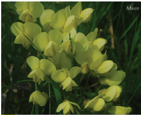
Cream False Indigo Baptisia bracteata