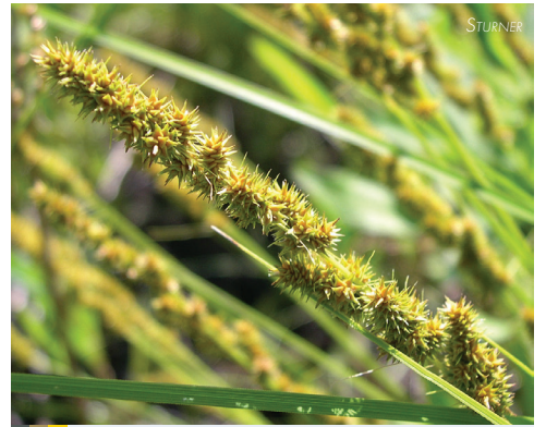
Fox Sedge Carex vulpinoidea