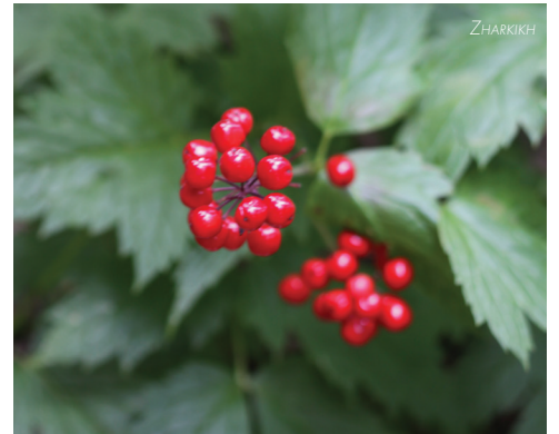
Red Baneberry Actaea rubra