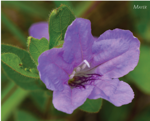
Wild Petunia Ruellia humilis