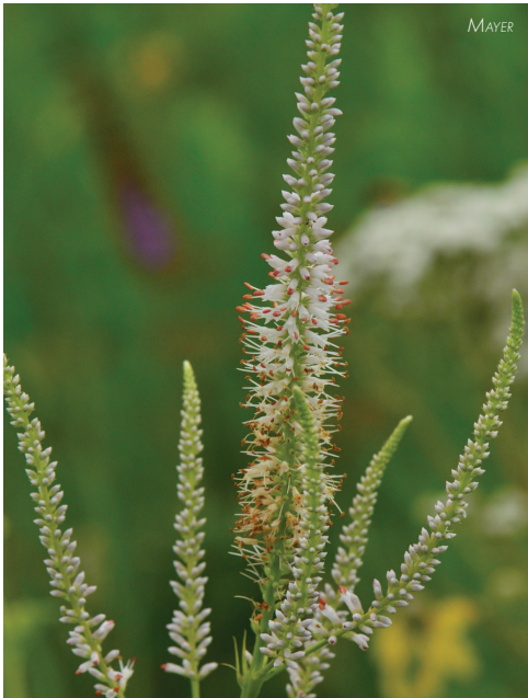
Culver's Root Veronicastrum virginicum