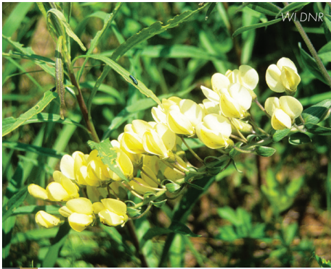
White False Indigo Baptisia alba