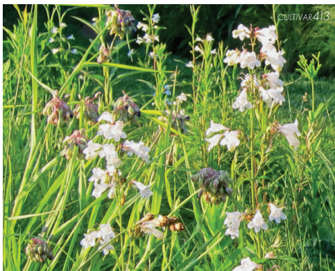
Foxglove Beardtongue Penstemon digitalis