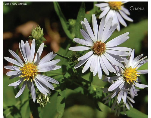
Crooked Stem Aster Aster prenanthoides