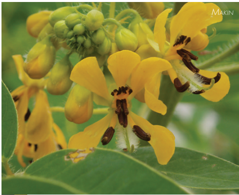
Wild Senna Cassia hebecarpa