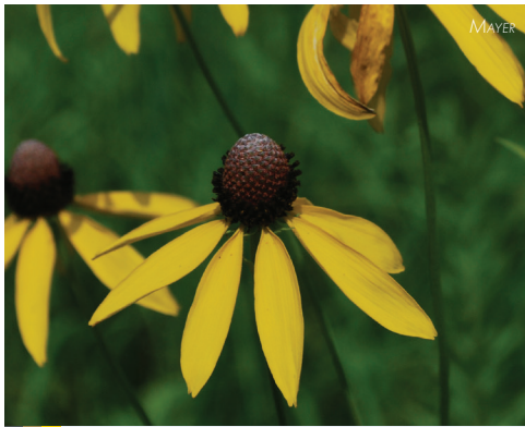
Yellow Coneflower Ratibida pinnata