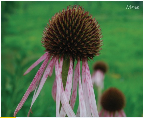
Pale Purple Coneflower Echinacea pallida