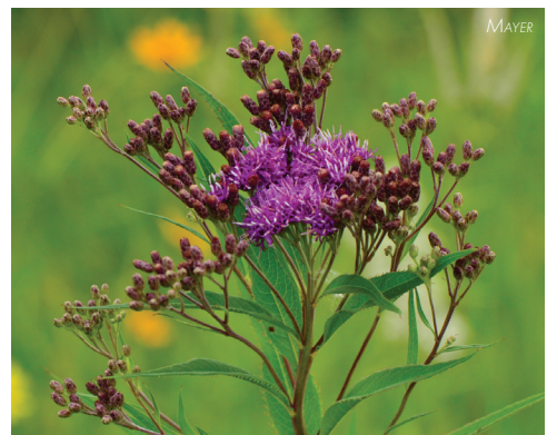
Ironweed Vernonia fasciculata