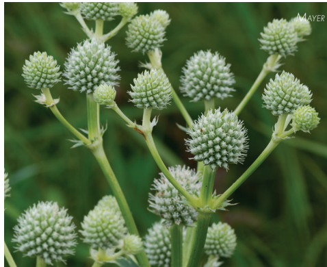
Rattlesnake Master Eryngium yuccifolium