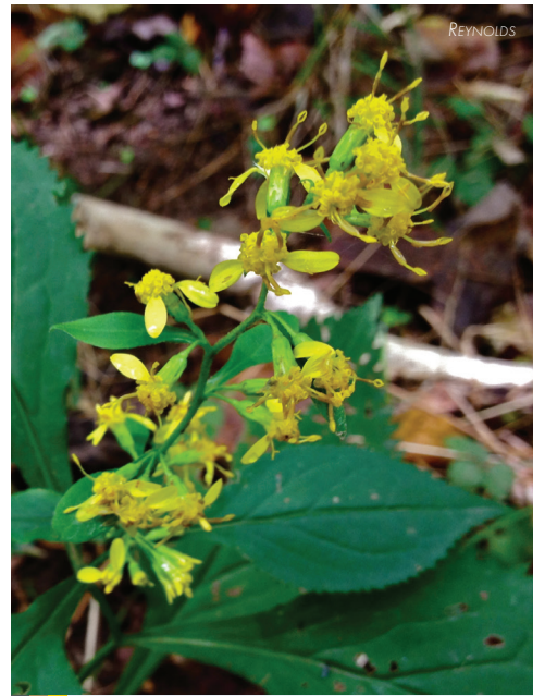
Zig Zag Goldenrod Solidago flexicaulis