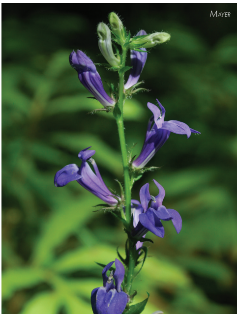
Great Blue Lobelia Lobelia siphilitica