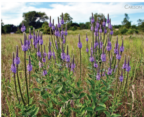
Hoary Vervain Verbena stricta