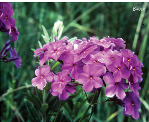
Smooth Phlox Phlox glaberrima