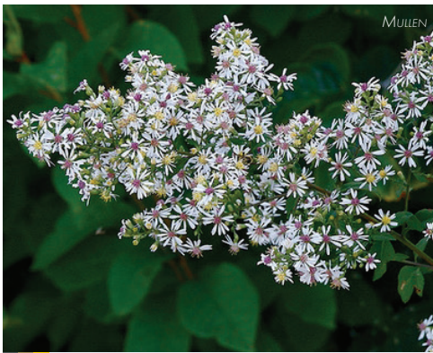
Calico Aster Aster lateriflorus