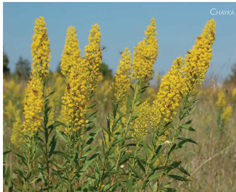
Showy Goldenrod Solidago speciosa