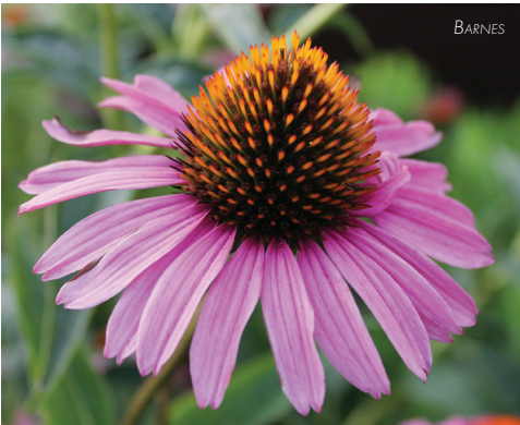
Purple Coneflower Echinacea purpurea