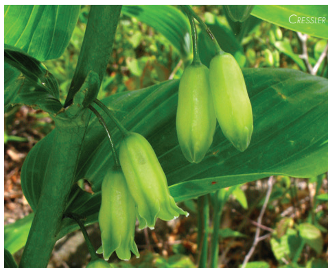
Solomon's Seal Polygonatum biflorum