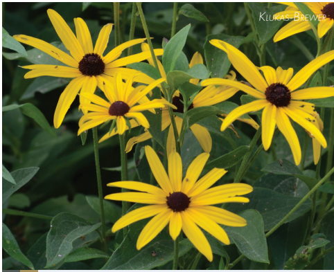
Sweet Black Eyed Susan Rudbeckia subtomentosa