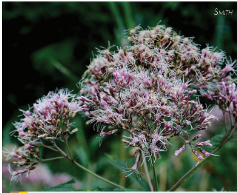
Sweet Joe Pye Weed Eupatorium purpureum