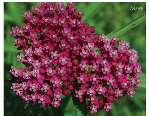
Swamp Milkweed Asclepias incarnata