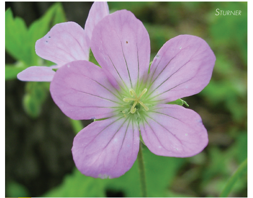
Wild Geranium Geranium maculatum