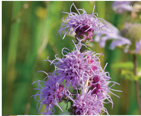
Prairie Blazing Star Liatris pycnostachya