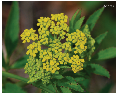
Golden Alexander Zizia aurea