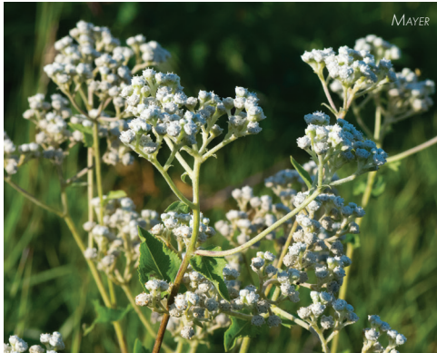
Wild Quinine Parthenium integrifolium