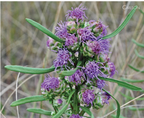
Rough Blazing Star Liatris aspera