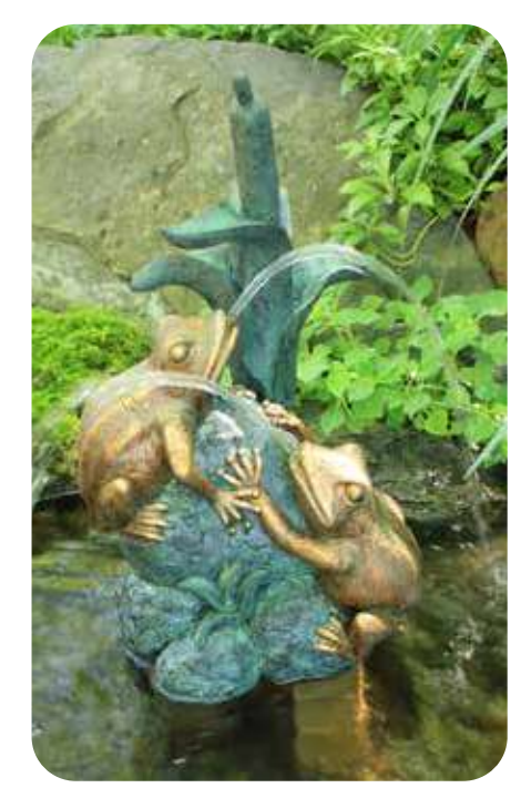
Double Frog with Cattail Spitter

What makes your pond unique? Individualize your water feature with <u>decorative aspects</u> including ornamental spitters and fountains. Whether you prefer a water-spitting frog or bamboo fountain, the possibilities are endless.