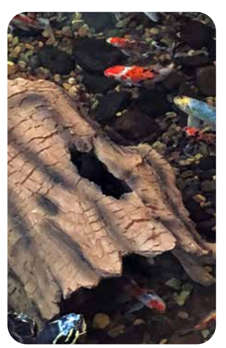
Faux Oak Stump Cover