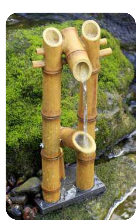
Deer Scarer Bamboo Fountain