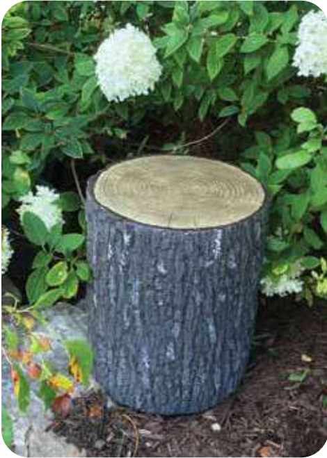
Faux Oak Stump Cover

Aquascape also offers other decorative elements to enhance your water feature. The Faux Oak Stump Cover is perfect for hiding electrical components, while our Faux Driftwood is ideal for concealing the spillway opening or adding a decorative element.