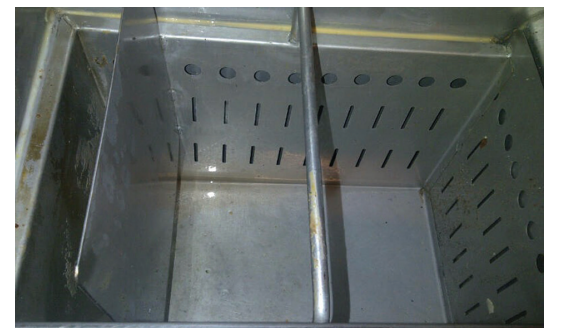
AFTER: Clean Grease Trap

F.O.G's application specific bacterial package was selected for its accelerated degradation capabilities of organic compounds.