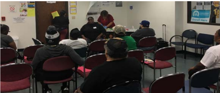
MCCN nutrition class program activity photo in Inglewood site.

The program collaboration provides free healthy lifestyle nutrition and physical activity classes for MCCN patients and their families every Friday starting on February 2018. Topics for each week are (1) basic nutrition, (2) Physical Activity, (3) Rethink Your Drink and (4) Diet Related Diseases. Educational resources / cookbooks/ handouts are given to the patients/participants including Health Advocate Certificate upon completion of four week sessions. For information and registration, please contact Jessica Chavez, Community Outreach Coordinator at 818.895.3100 Ext 742.