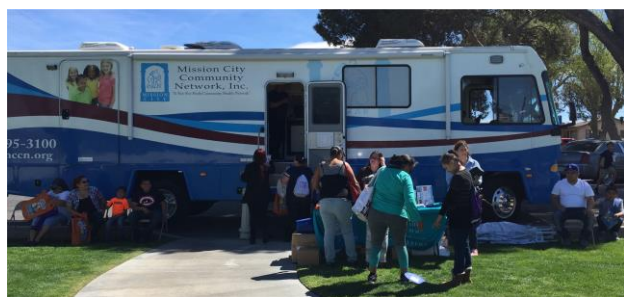
MCCN mobile physical examination and screening services during New Mexico Chili Cook Off & Belen Fiesta in Barstow.