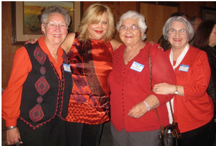
Installation Banquet Photos

Remember the superior pilot uses their superior judgment and knowledge to prevent having to show their superior skills.