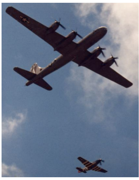
Check us out at LVAA.ORG