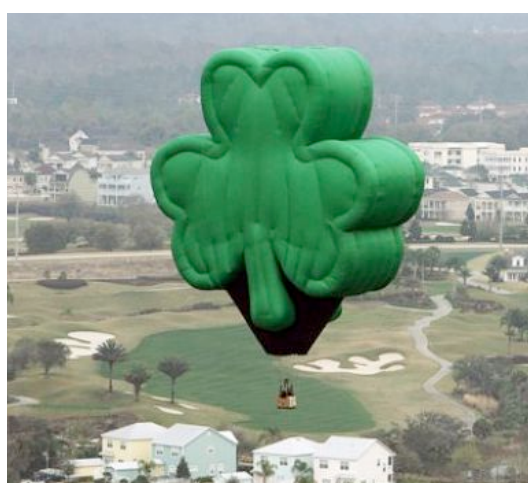
Check us out at LVAA.ORG