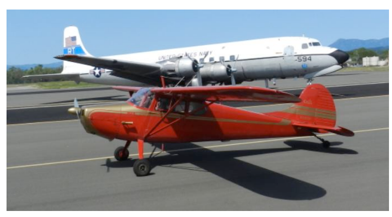
Check us out at LVAA.ORG