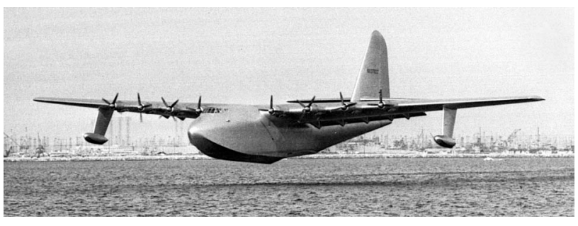
Sixty-five years ago on November 2nd, 1947...