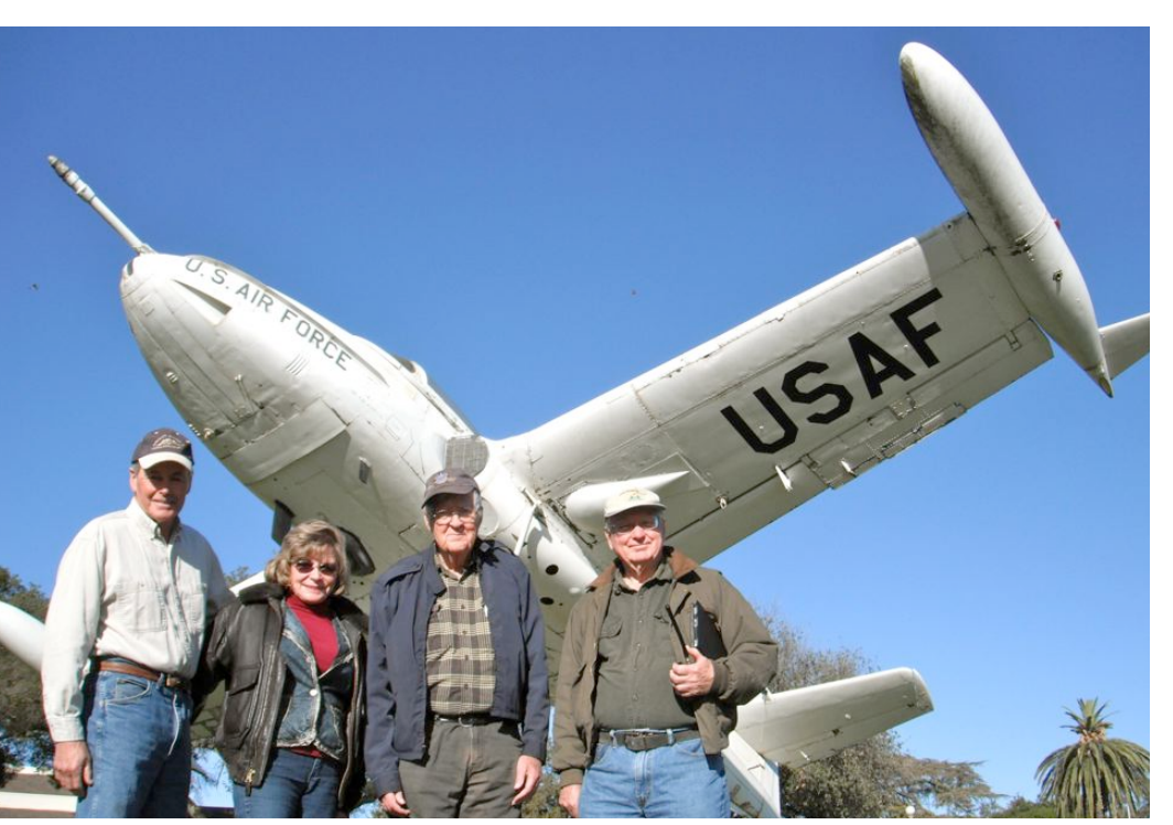
Reach For The Stars!