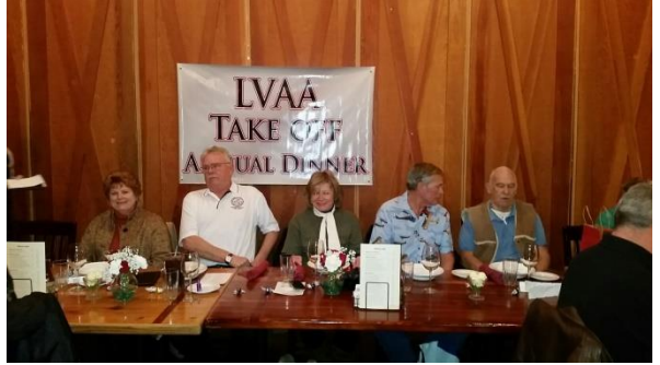
Holiday Pot Luck Dinner November 2015