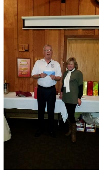
Take Off Annual Dinner January 2016