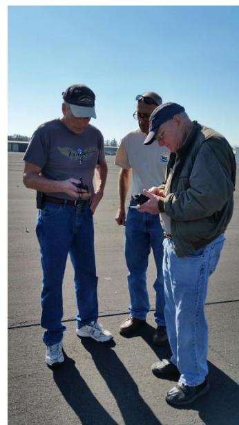
Modesto Fly-Out....."Three heads are better than one", figuring out the radio!