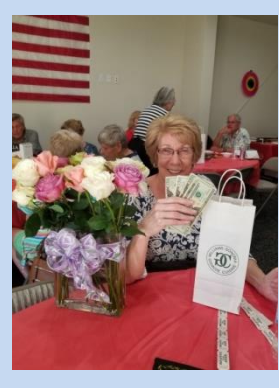
3x the Winner !!!